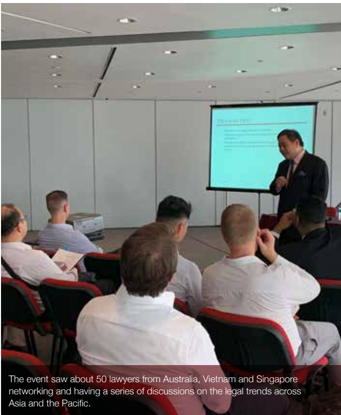
The event saw about 50 lawyers from Australia, Vietnam and Singapore networking and having a series of discussions on the legal trends across Asia and the Pacific.