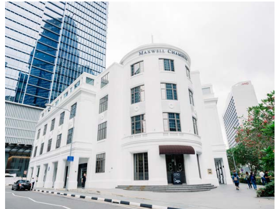
Maxwell Chambers in Singapore currently houses under one roof, partners in arbitration, including the Singapore International Arbitration Centre (SIAC), International Court of Arbitration of the International Chamber of Commerce (ICC) and Permanent Court of Arbitration (PCA), among others.

The certification was included when the SICC was originally set up to give parties the option of having these issues determined early, as the SICC