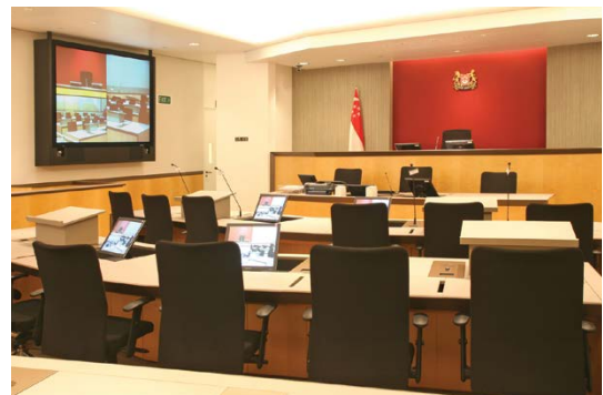
One of the courtrooms in the Supreme Court of Singapore.