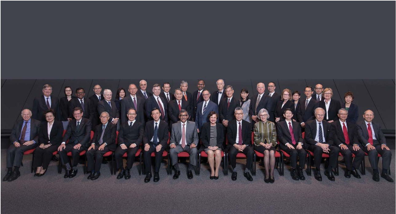
The bench of the Singapore International Commercial Court.